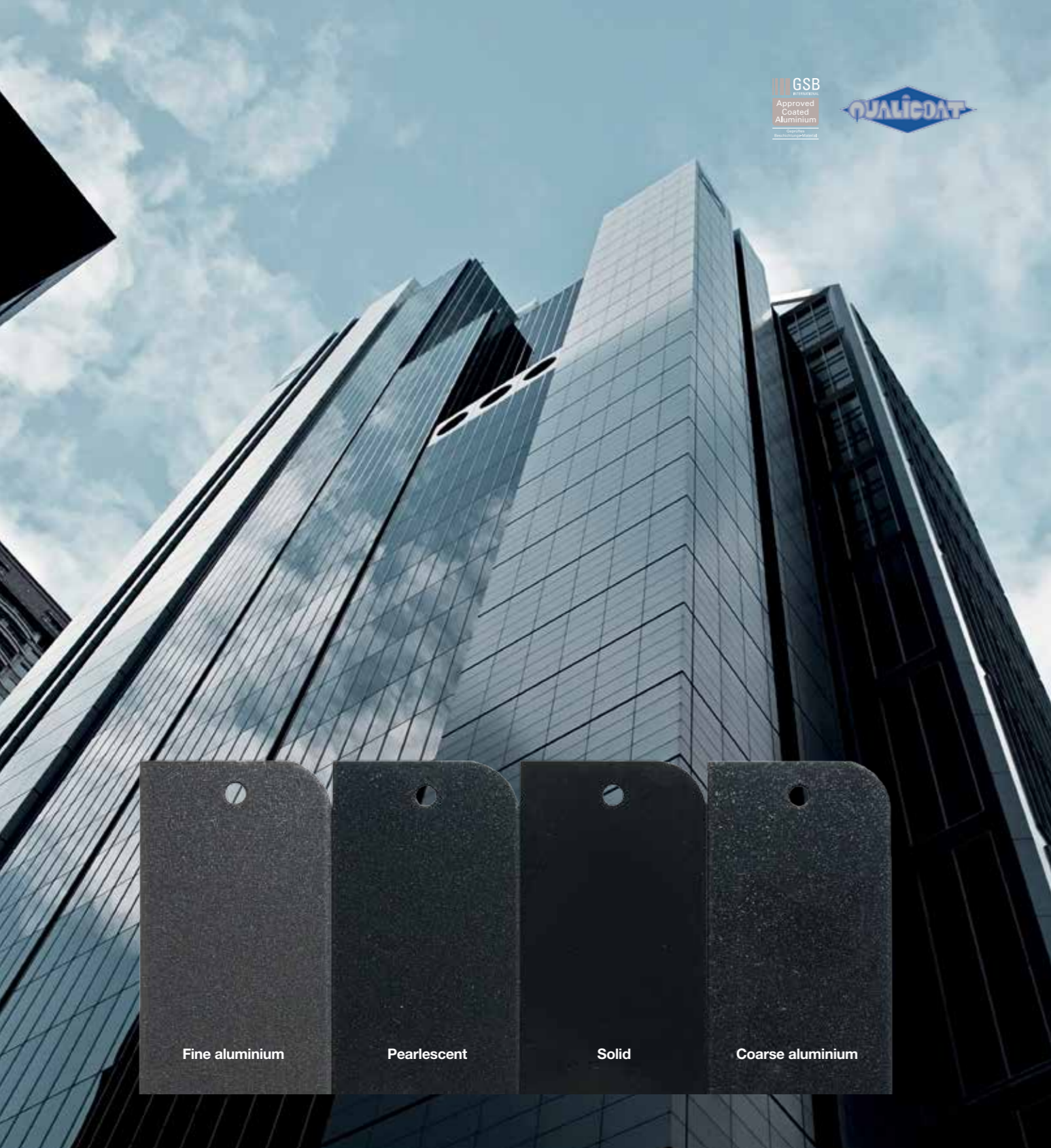
Fine aluminium Pearlescent Solid Coarse aluminium